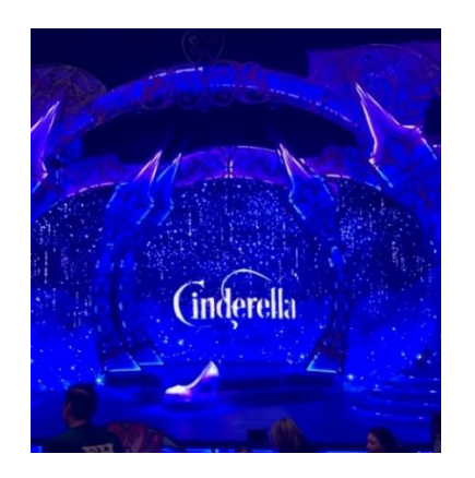
The children (and adults!) joined in with the singing, dancing and shouting - it's behind you! A fabulous, joyful time was had by all.

Last week, a group of our children were fortunate to attend a panto. Oh yes they did! Forty five pupils headed off to Fairfield Halls by coach to watch Cinderella.