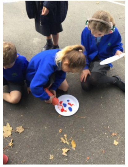
The last activity we did was to create art by throwing paper plates! We put drops

Next we went on the playground equipment. We were investigating if they used a pushing or pulling force and how friction and used. We gravity was discovered that the supernova uses a pushing force because it requires a push to turn it. The climbing blocks use a push and pull, you push with your legs but you pull with your arms.