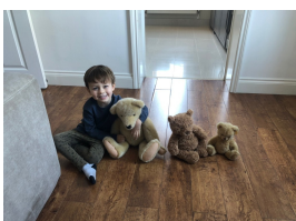
Ordering bears after reading the story 'Titch'.