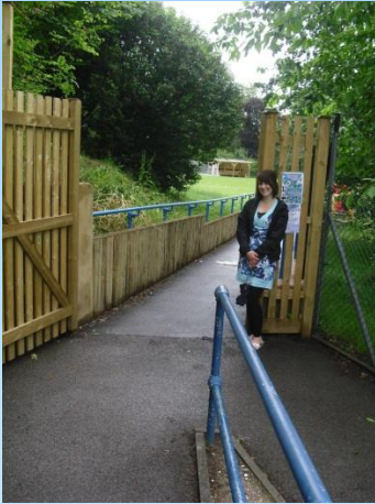
Harbury Road Entrance

Children will come to school at 9.00 am. You will accompany your child to the Reception garden gate from the Harbury Road entrance or the Radcliffe Garden's entrance and leave via the Beansos gate.