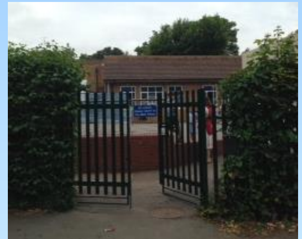
Radcliffe Gardens Entrance