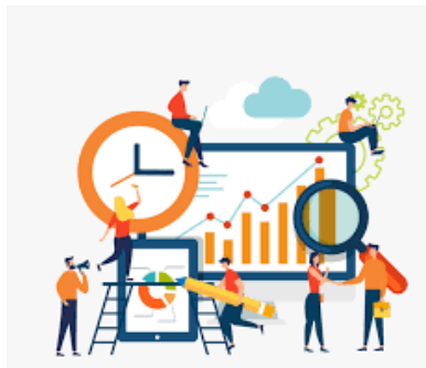
Chart – also called a — — ● graph is used to show data.

Data – Information ●●●● gathered on a particular subject.