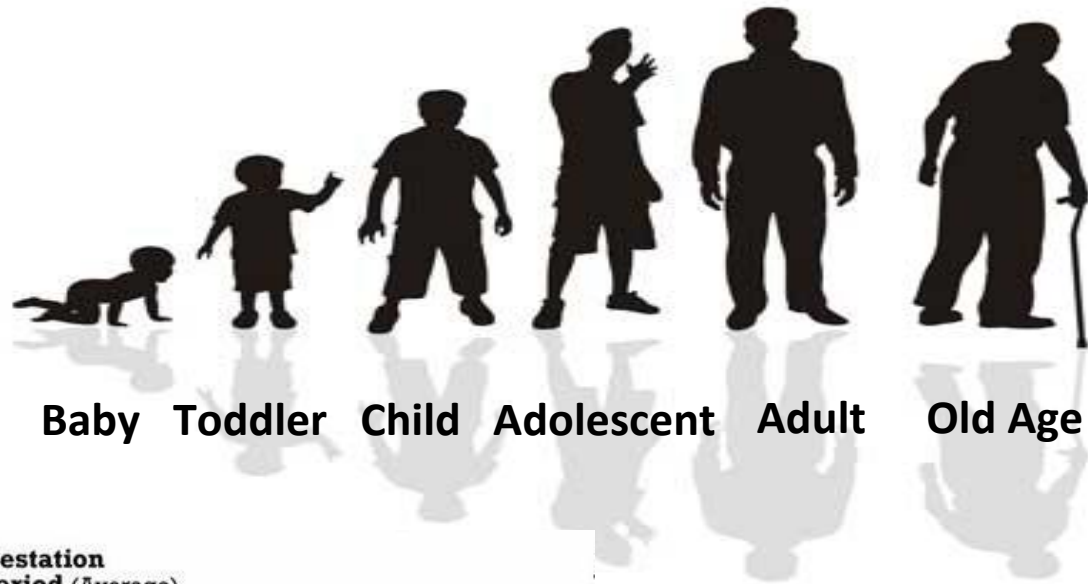
Baby Toddler Child Adolescent Adult Old Age