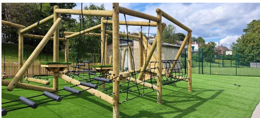
Trim trail – funding received from the borough – c.£56k