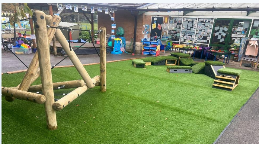
Nursery – funding received from the borough c.£12k

As a result, the funds currently sitting in the PTFA accounts are larger than that which were planned to be – however, this is a positive ‘problem’ to have!